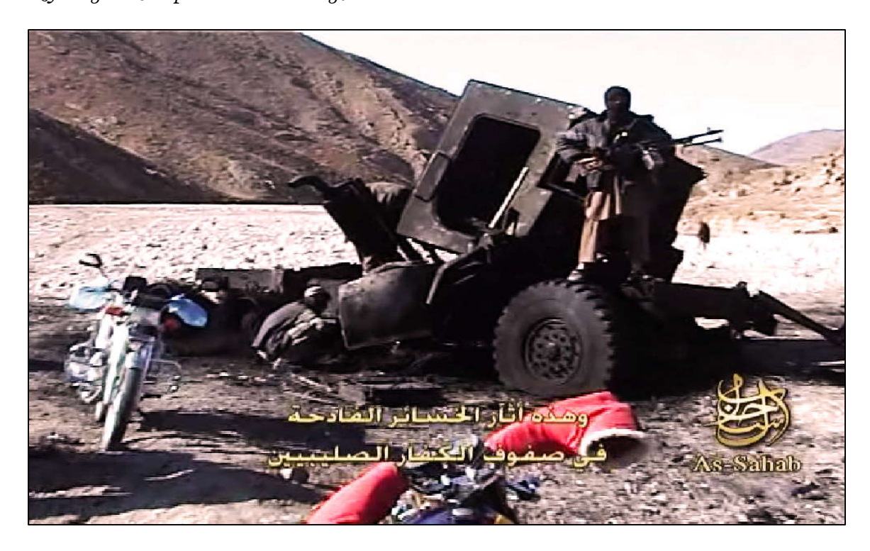
l) Their Jihaad against the Disbelievers and Hypocrites. Allah prefers the Mujaahideen over the Qaa'ideen (those who sit back) as He mentioned in an-Nisa' (aayaat 95-6) and so we must love those whom Allah loves.