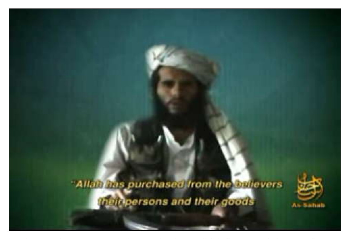
k) Their implementation of al-Walaa' wal Baraa'ah (alliance and disavowal) for the sake of Allah Ta'aala.

j) How they remind each other and the Ummah of the aayaat of Qur'aan for the purpose of making the Muslims worship their Lord properly.