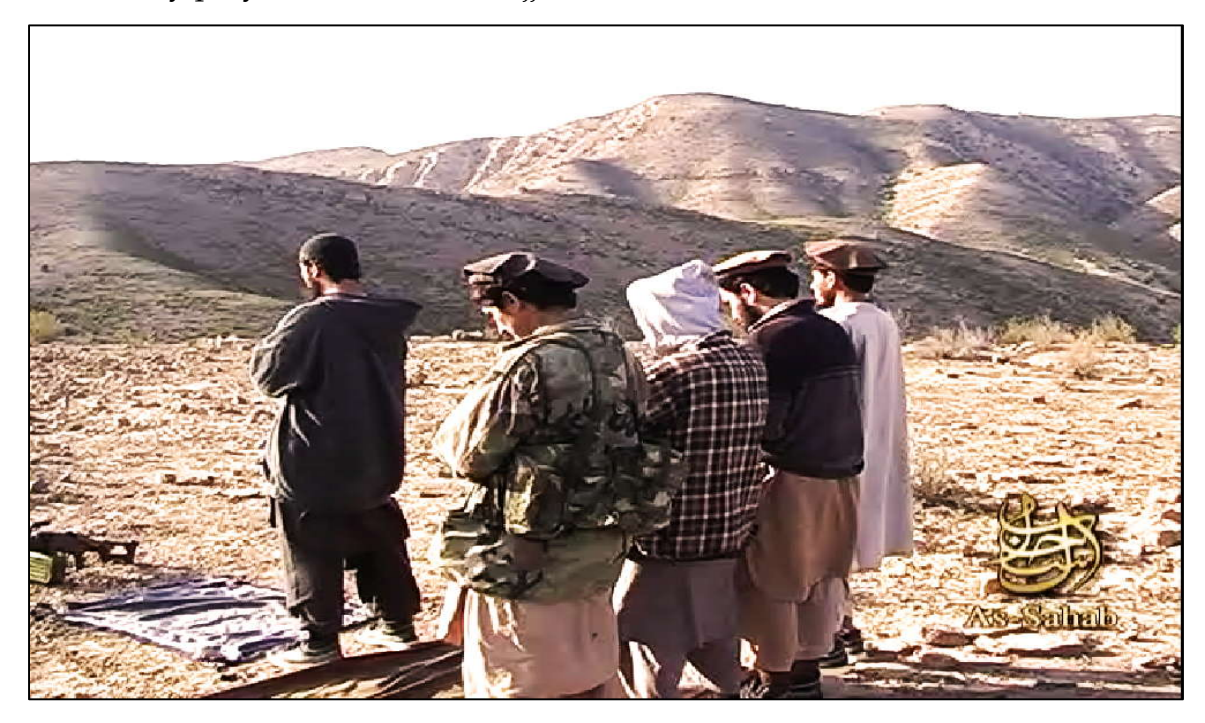
b) The recitation of Qur'aan. They show their fighters reading Qur'aan as well as other Islaamic texts.

a) The performance of Salawaat. They show their fighters praying the 5 mandatory prayers as well as Tahajjud.